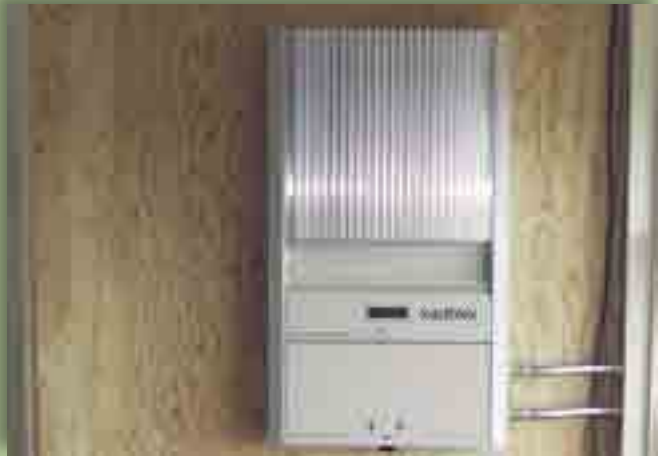
The Xantrex GT3 series inverter assembly complete (above), and with the inverter removed, leaving the handy wiring box (shown open, at right).